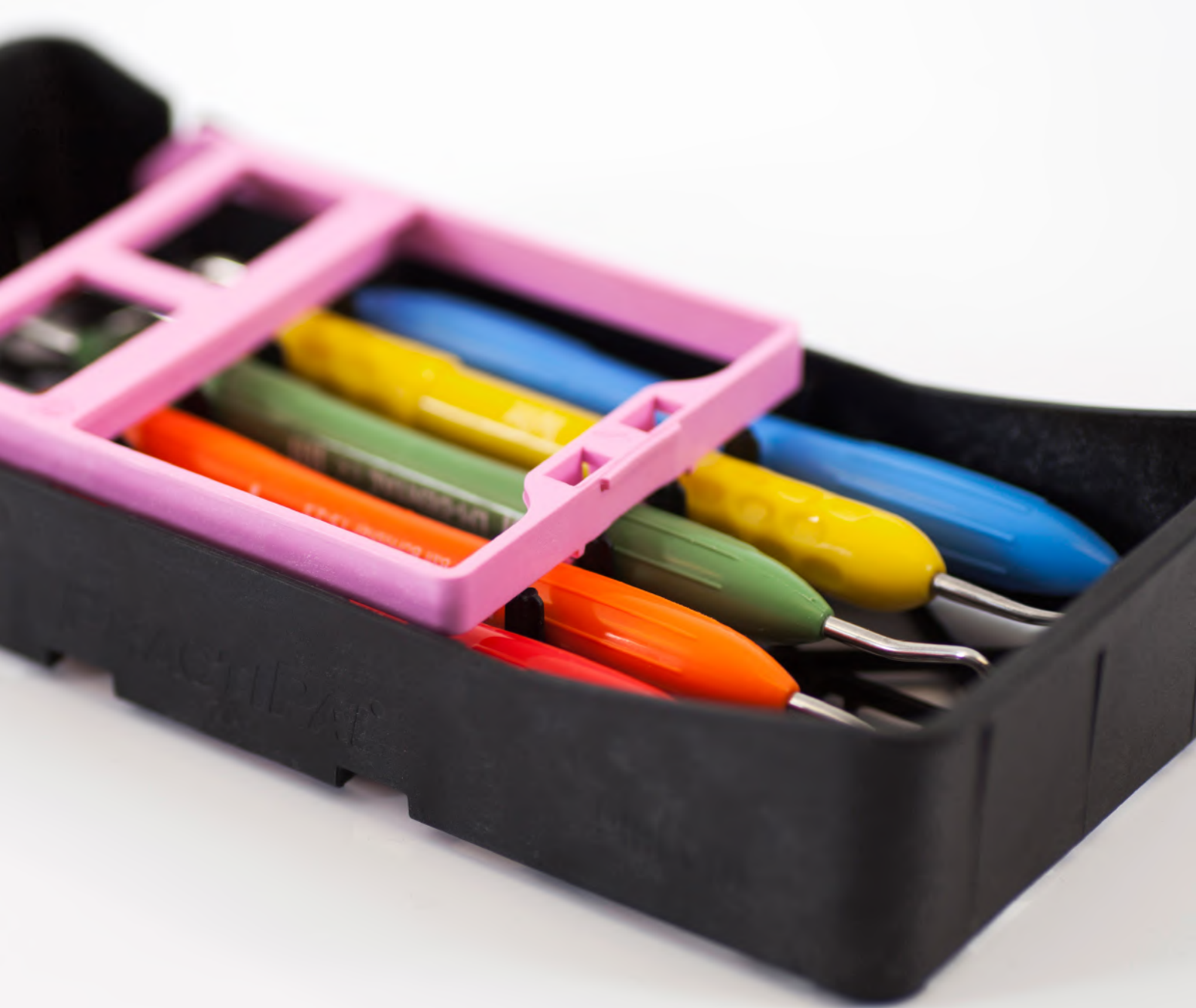
PractiPal® Mini Tray