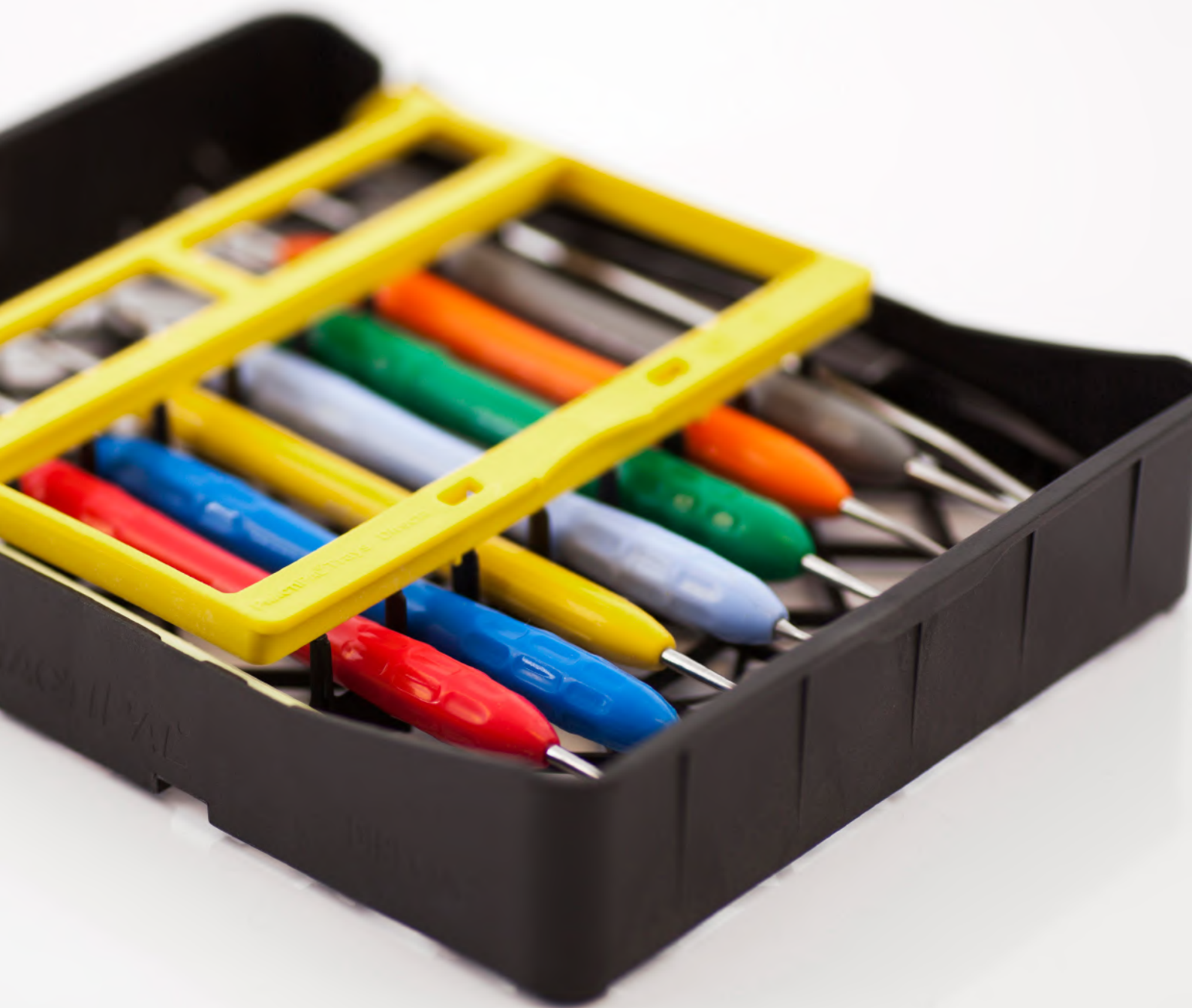
PractiPal® Half Tray