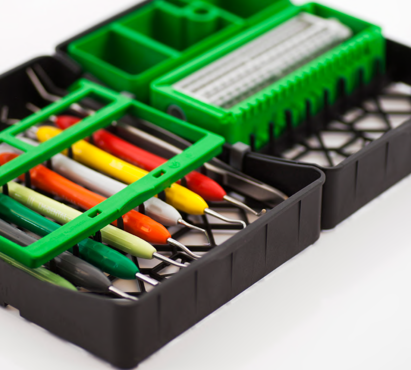
PractiPal® Full Tray